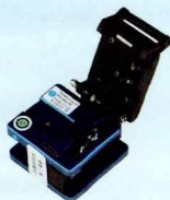
Optical fiber cleaver 光纤割刀