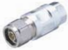
N Male F4PNMV2-H