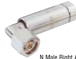
N Male Right Angle F4PNR-H