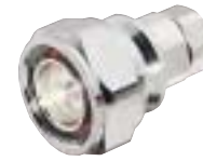
7-16 DIN Male F4PDMV2-C