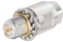
N Female Bulkhead F4PNF-BH