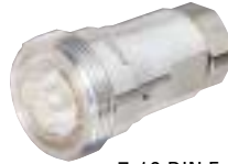
7-16 DIN Female F4PDF-C