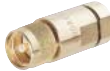
UHF Male 44ASP